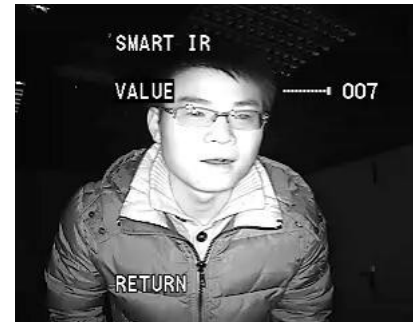
Smart IR Camera