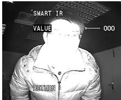
General IR Camera

In some case of misjudging the length of IR range and subjects, IR cameras lead to frequently over-exposed subjects. That's why smart IR is there to solve this type of issue by adjusting automatically IR light and based on subject's distance, resulting in a clear image that is not washed out or too dark.