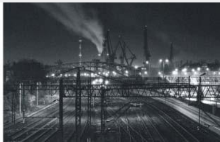
With 3D DNR